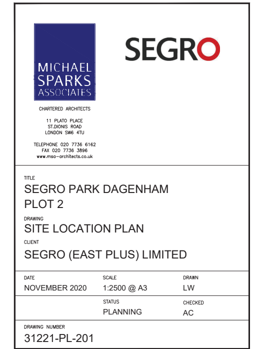
01 201 SITE LOCATION PLAN 1:2500